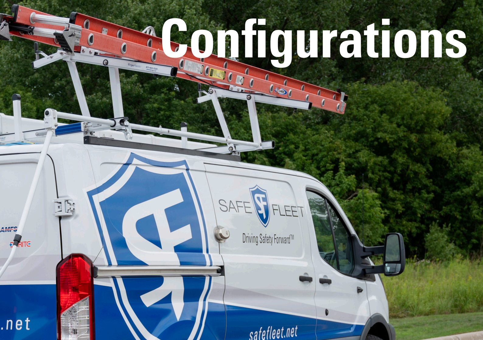
Combo, Rotation, Clamp down, 3rd crossbar