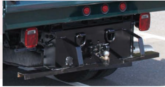
Pintle and Receiver Hitch Plates