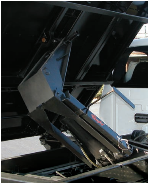
Multi-Directional dumping hoist specifically designed for the Eliminator MD body.

Dumping direction is easily controlled with one lever and Rugby's standard tailgate release controls both the rear and the side release. The Eliminator MD includes Rugby's patented EZ-LATCH™. Standard vertical side and tailgate braces along with the Eliminator's sleek design offer the complete package to make your work truck stand out!