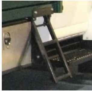
Two Rung Ladder