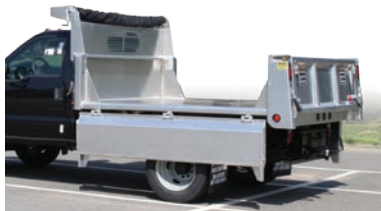
Fold down aluminum sides are lightweight and easy to operate.