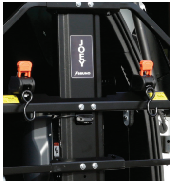
Barrier belt kit* includes two retractable securement straps for added peace of mind.