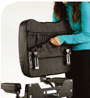
Back-Off easily removes back of mobility device to fit into shorter vehicle openings.