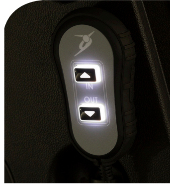
One button control with indicator light.