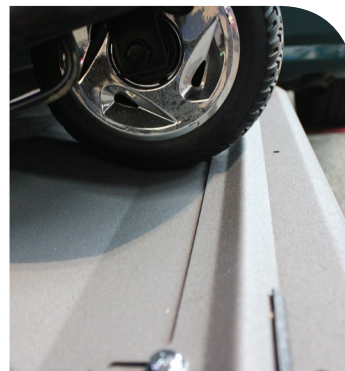
Wheel chock kit required for FWD powerchairs.