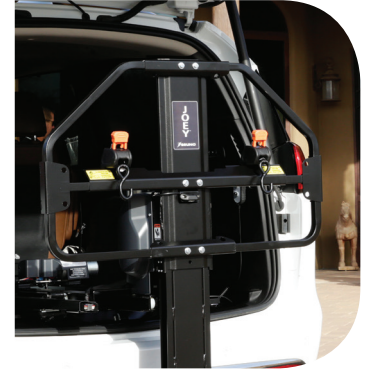
Industry-exclusive safety barrier. Protected by US Utility Patent No. 403.615